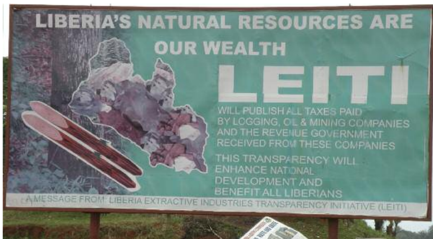
Board of Liberia Extractive Industry Transparency Initiative, Bong County

In environmental terms, one of the largest challenges the company faces is to properly conduct, release and implement the Environmental Impact Assessment (EIA) for its mining operations in the Nimba Mountains. Located on the borders of Guinea, Liberia and Côte d'Ivoire, Nimba Mountain, excluding Liberia's portion, has been a nature reserve since 1944. Currently, covering 180 km 2 , the Mount Nimba Strict Nature Reserve is classified as a World Heritage Site, including both rainforest and savannah. It is a "strict" reserve, forbidding even tourism. 13