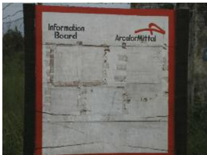
ArcelorMittal information board near company facilities in Buchanan in Grand Bassa County.

The company also managed the reconstruction work of the railroad from Buchanan to Yekepa. The company implemented a work plan that divided work on the railroad among workers from 35 communities located along the length of the track. The majority of the work on the railroad was conducted by a subcontractor – Brazilian multinational company Odebrecht. Serious labour issues have been reported to GAAM by former employees, such as obligatory 12 hour workdays with 1 hour of unpaid lunch. US$0.38/ hr. of overtime was paid for the unskilled workforce while regular workers overtime was calculated at US$0.58/ hr. This remuneration level for such effort and length of work under local climatic conditions is inadequate.