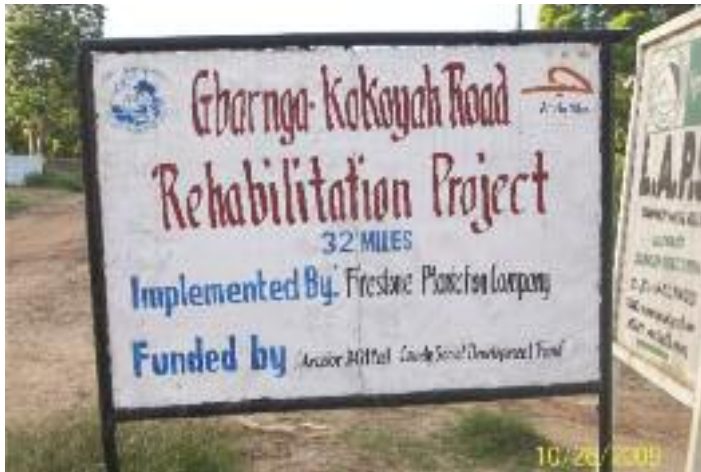
Signpost claiming that the Gbarnga - Kokoyah road was constructed using ArcelorMittal funds for CSDF