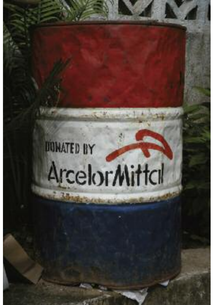
Donated by ArcelorMittal.

The issues arising from this review go to the heart of the ethical debates about whether it is better for the corporations to make voluntary social contributions or to pay taxes that are negotiated in a fair and transparent manner, during contract negotiations. For example, in the previous contract with the interim government of Liberia, ArcelorMittal enjoyed a tax holiday and was given control of major state assets. Ironically, it was in that contract that the idea of the Social Development Fund, which became a key selling point of the contract, was introduced. This contract was made void by the newly elected government, after international pressure, as the contract heavily favoured ArcelorMittal (This was prior to the merger with Arcelor).