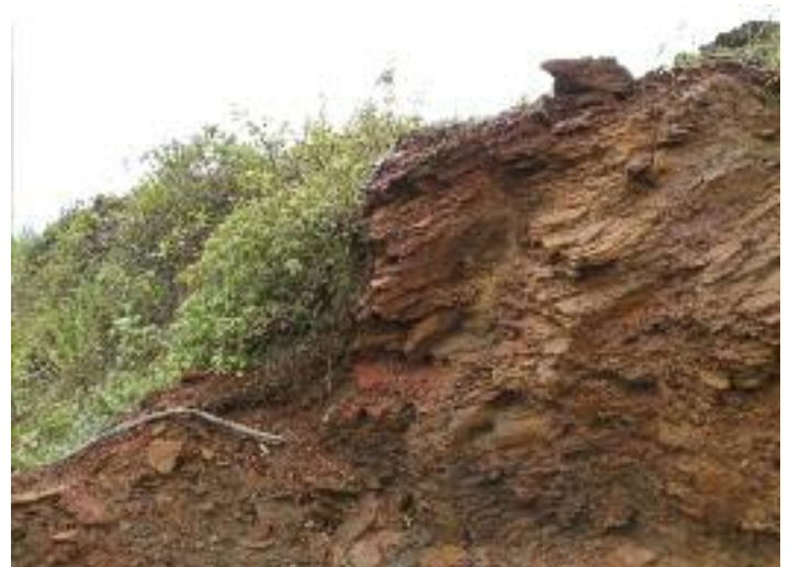
Iron ore, rock Tokadeh Mine, Nimba County