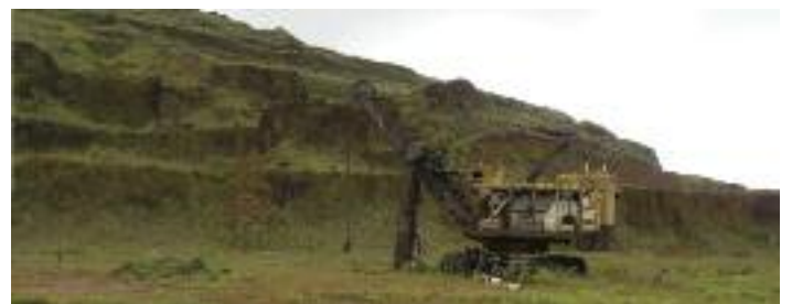
Old mining excavator in Tokadeh Mine, Nimba Mountains