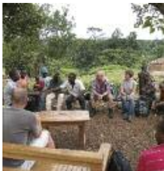
GAAM meeting with the inhabitants of Barpa, Nimba County.

There is public dissatisfaction with the manner in which the fund is being managed by the government and ArcelorMittal. Reports of misappropriation and misuse of the fund are widespread, but none of those implicated in the alleged misuse of money from the fund, has been investigated or punished. Although the President, H. E. Ellen Johnson Sirleaf lamented this in her state of the nation address in January, to date there has been no indication that anyone will be held accountable for the misuse of the funds. Instead of the fund contributing to the government’s efforts to meet the objectives of the Poverty Reduction Strategy, it is apparent that the fund has been turned into a cash cow for corrupt local officials and their agents. This raises doubts about whether the fund will achieve its stated objectives of improving the lives of peoples affected by ArcelorMittal operations in Liberia.