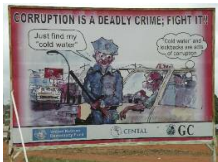
Corruption remains major problem in Liberia

We have assessed if this donation – and other aspects of ArcelorMittal’s performance – is in line with the OECD Guidelines for Multinational Enterprises. These guidelines are recommendations addressed by governments to multinational enterprises. They provide voluntary principles and standards for responsible business conduct consistent with applicable laws. The guidelines aim to ensure that the operations of these enterprises are in harmony with government policies, to strengthen the basis of mutual confidence between enterprises and the societies in which they operate, to help improve the foreign investment climate and to enhance the contribution to sustainable development made by multinational enterprises. 30