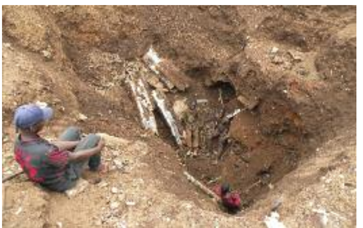
Scrap diggers

ArcelorMittal could arrange for rehabilitation of the dumpsite area, not only because of its proximity to people's houses but also to show its commitment to a clean environment and to provide employment for local people using the company's engineering and safety know-how. ArcelorMittal could also use this opportunity to 'provide training for Liberian citizens for skilled, technical, administrative and managerial positions' as it is committed to by the MDA.