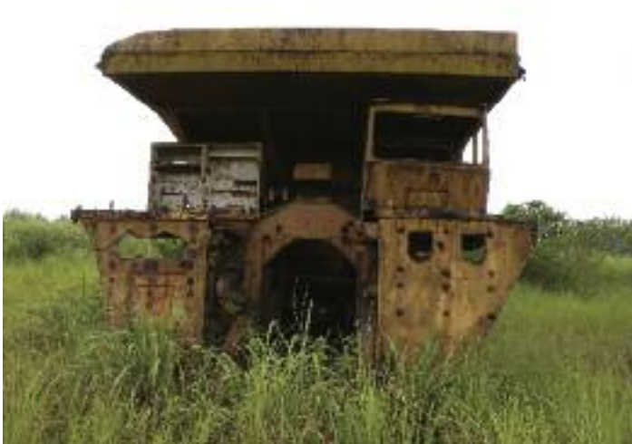
Damaged Lamco truck near Yekepa, Nimab County

ArcelorMittal will also be the third largest and most powerful private company in the country after BHP and China Union, so the pressure on it to deliver more in this respect is likely to escalate. Furthermore, as ArcelorMittal was the first company to invest in iron ore mining, its performance is likely to set the standard for the other mining companies.