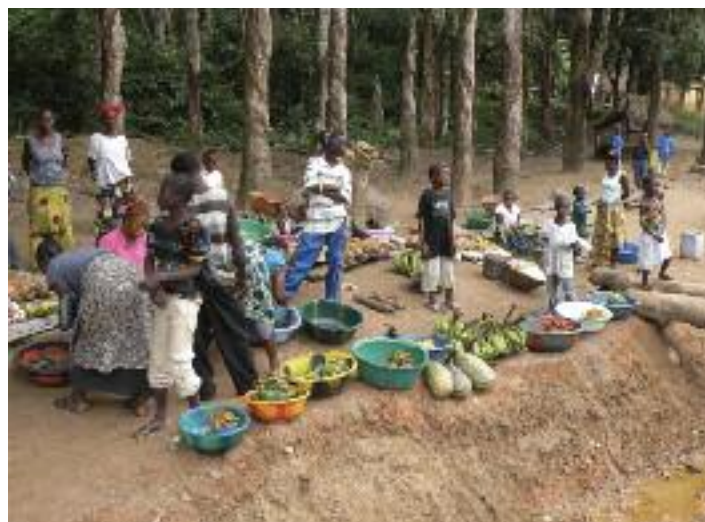
Road market, Nimba County

GAAM is very seriously concerned with the lack of EPA capacity to monitor the iron ore investments in Liberia. This problem will only increase when ArcelorMittal and other companies start full operations. The EPA has also indicated to GAAM that it lacks well-developed standards for monitoring of certain activities not to mention the tools to conduct this monitoring. This issue needs to be urgently addressed by the government of Liberia.