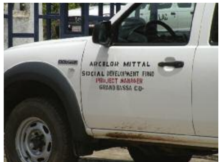
Pick up truck used by CSDF Project Manager in Grand Bassa